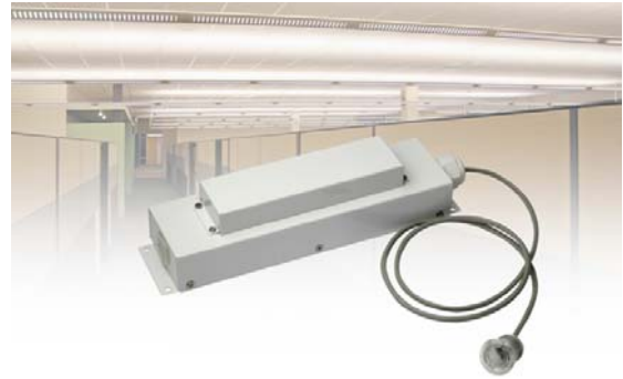
Picture shows a converter kit including umbilical cord with integrated module containing indicator LEDs and Infra-red communication interface