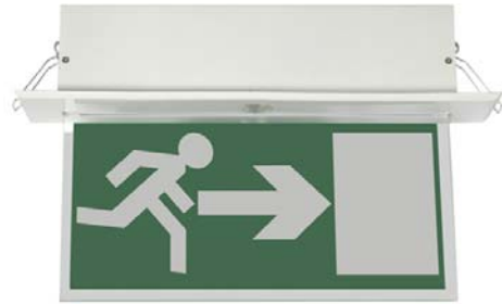
Flush mount unit